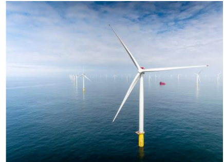
Indicative Offshore Wind Farm: Dudgeon, UK