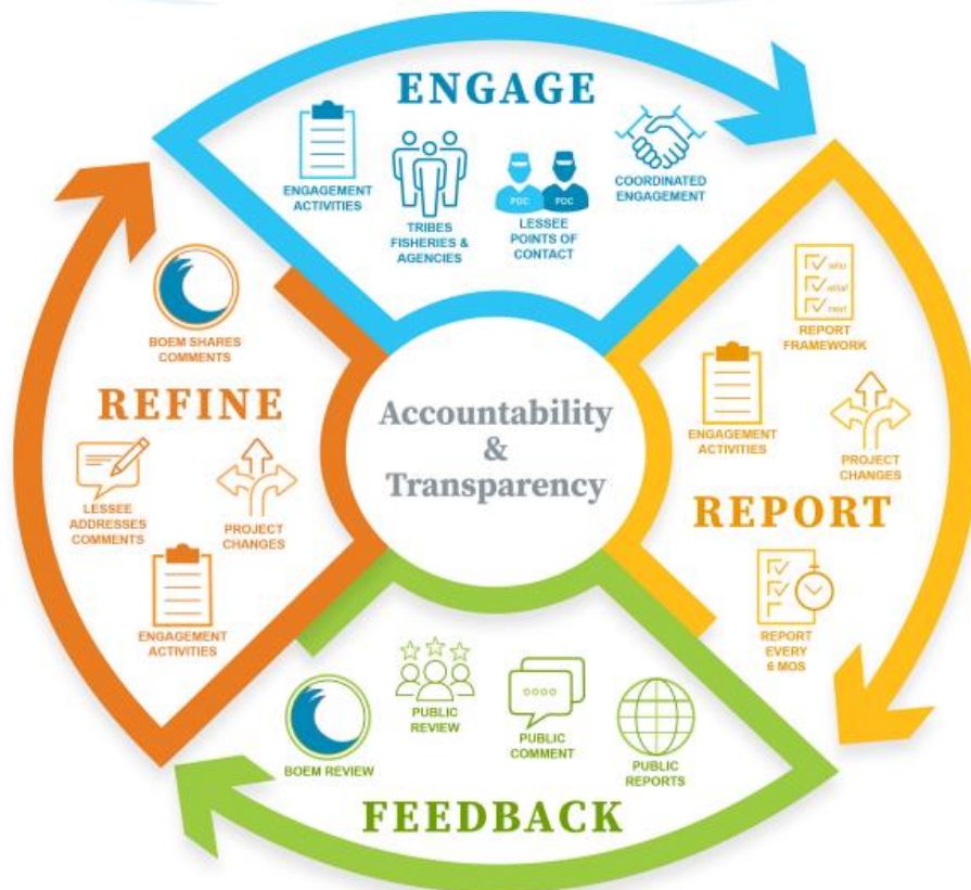
BOEM Stakeholder Communication Approach

The OW East FCP has been developed based on BOEM guidelines and best management practices (BMPs) guidance from other relevant resources (Attachment A). The objective is to define outreach and engagement strategies for fisheries interests that may be affected during the planning, construction, operation, and eventual decommissioning of the Project. These strategies will be enhanced with inputs received from the fishing community and updated as the Project progresses.